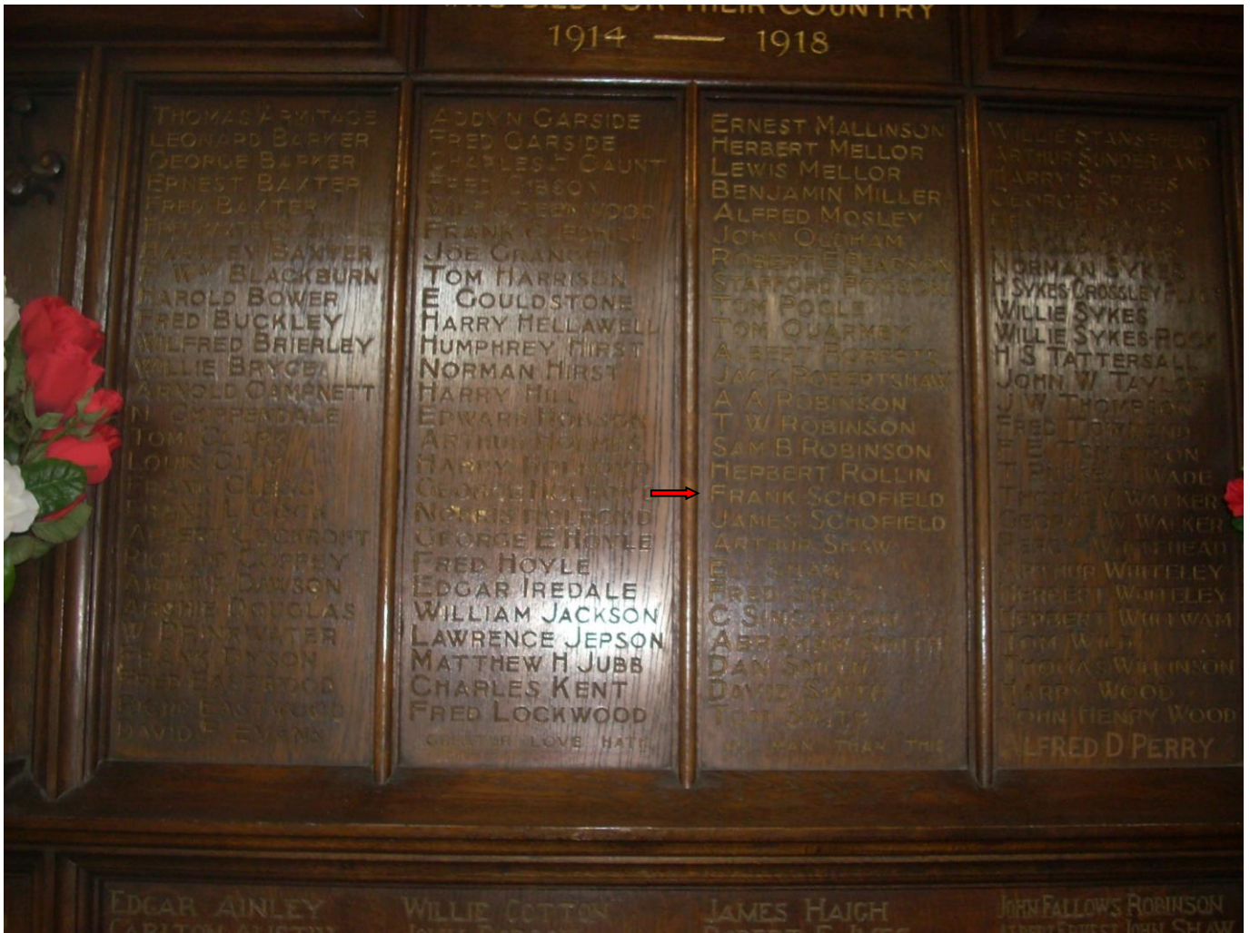
Linthwaite Roll of Honour