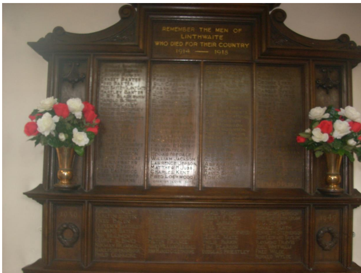
Linthwaite Roll of Honour